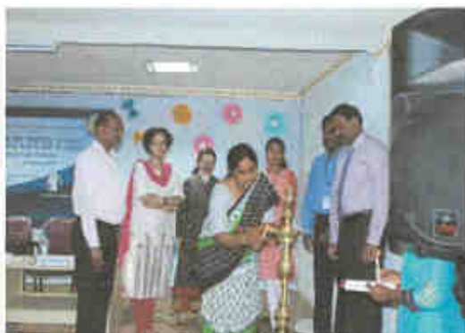
Inaugural function of the Workshop