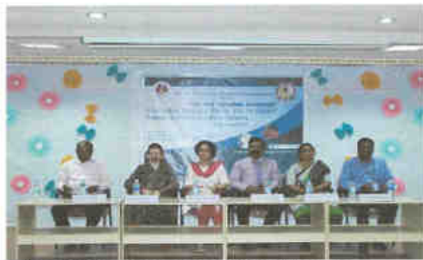
Inaugural function of the Workshop

The workshop gave an outline about IPR in the pharmaceutical profession and health care sector. The special provisions of patents and also the exclusions applicable in the Pharma area were discussed.